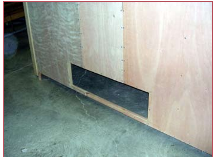
Cutout for the display table