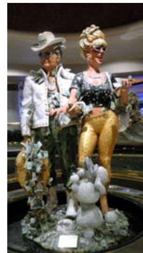
The subtlety that is Las Vegas