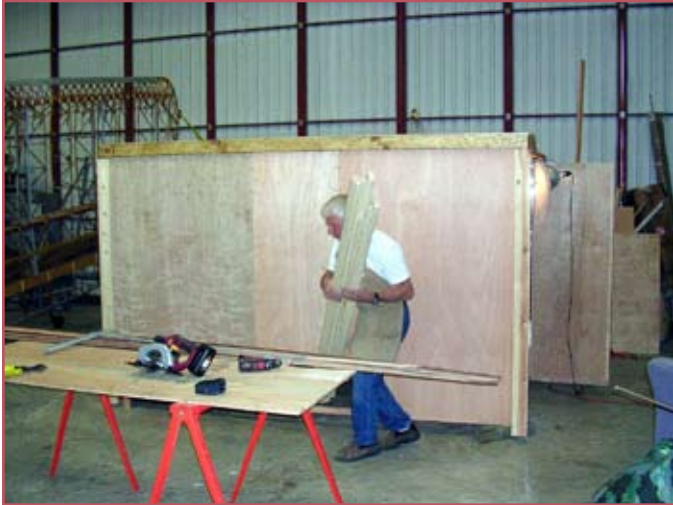
Side view of the unit

We are progressing on building the mobile gift shop. Here are some photos of the progress. It currently looks like a big box that will be mounted on a trailer chassis 10 feet long x 6 feet wide x 6 feet high. The rectangular cutout on the side is for the display table to slide out on, and there will be 2 TV's mounted on the same side to show videos of the museum. Stop by a see the progress. You can also donate to help defray the construction costs. Kudos to Doug for design and construction and to Peggy, Sita, and Susan for their input.