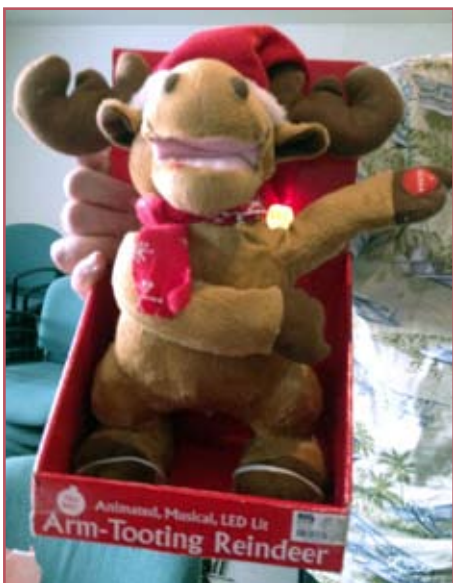
One of the more elegant gifts received