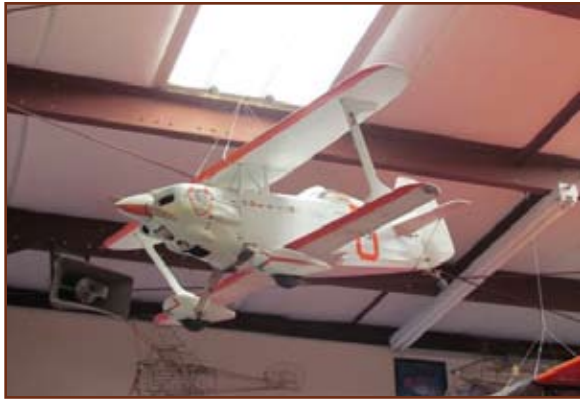
Knight Twister Model